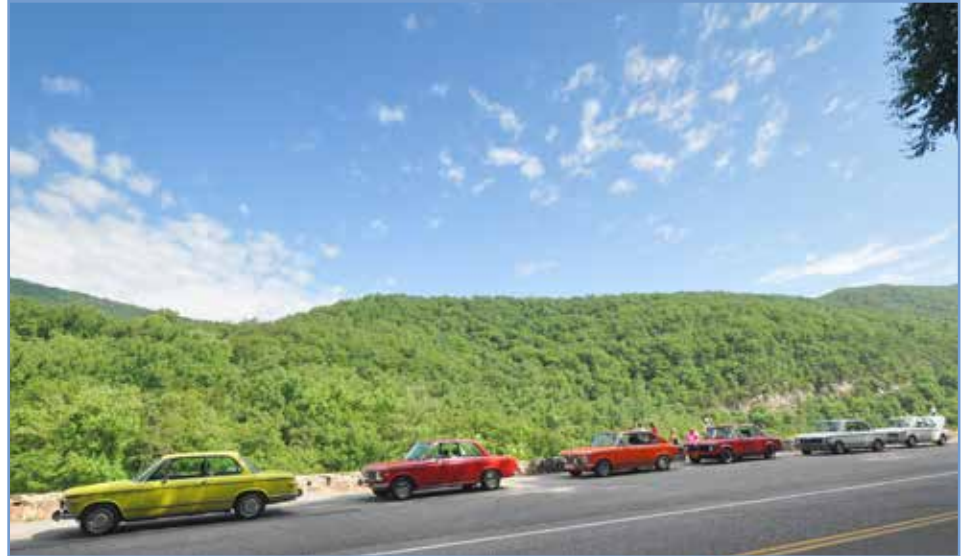
2002s at Goshen Pass

No surprise that the road nicked named the Back of the Dragon is one of the best in the state. I've never driven the famous Tail of the Dragon (US 129 in Deals Gap, NC) but I'm not sure I need