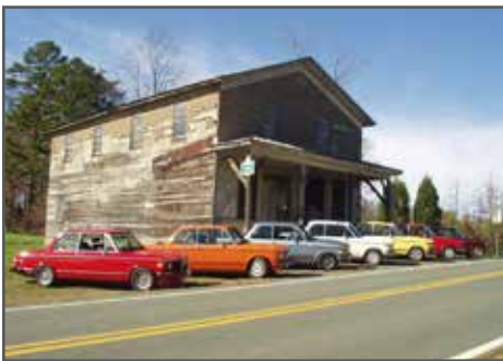
2002 drive from 2004. Uno, VA

VA 231 runs between Cismont and Sperryville. The run from Madison to Sperryville is one of my favorites and the view is Blue Ridge Mountains all the way. But if you start at Cismont (hit the Cismont Market for road snacks) you'll be treated to some lovely twisties and tiny rustic villages like the burgs of Uno and Rochelle before you cross US 29 on your way through Madison.